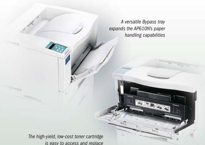
A versatile Bypass tray expands the AP610N's paper handling capabilities

A standard 500-sheet paper supply holds a full ream of letter-size paper and offers a versatile 100-sheet bypass (standard). Print onto plain paper, up to 11" x 17", and a wide range of media types, including transparencies, card stocks, recycled papers and custom paper sizes. Print envelopes with ease — up to 10 via the bypass or 60, via the optional Envelope Cassette. The optional Duplex Unit cuts paper usage, saving money and filing space. Add one or two 500-sheet paper feed trays to take your total paper capacity to 1,600 sheets , minimizing work interruptions.