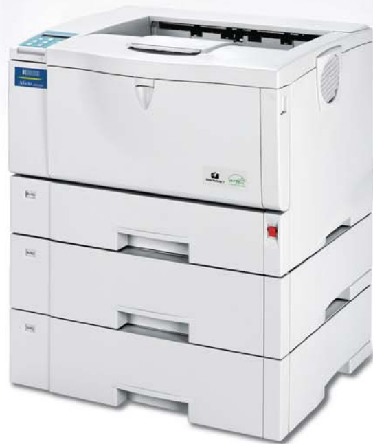
Fully configured Ricoh Aficio AP610N

When time is money, this workhorse printer won't disappoint. The AP610N's large expandable paper supply, easy maintenance, intuitive management utilities, and wide variety of connectivity options, including wireless, enable you to achieve maximum office productivity. Setting a new standard in workgroup printers, the affordable AP610N's seamless network integration, high reliability, and cost-efficiency make it an exceptional value...one uniquely engineered to boost your bottom line.